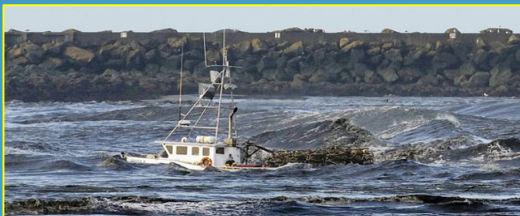
Boat attempting to leave Crescent City Harbor during the March 11, 2011 tsunami

If you do not have these essential preparedness items, DO NOT attempt to take your boat offshore. Secure your boat to the dock and leave the dock area before the tsunami arrives.