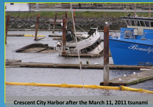
Crescent City Harbor after the March 11, 2011 tsunami